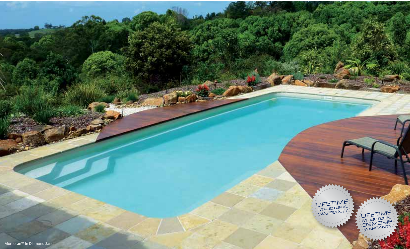
Moroccan™ in Diamond Sand

The Moroccan™ is the result of years of research, whereby Leisure Pools® designers were able to incorporate some of the most popular attributes of a pool into one stunning package. This is a swimming pool with more features than any other pool in today's market.